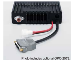
Photo includes optional OPC-2078.

The optional ACC cable allows you to connect with various external devices to control audio output, modulated signal input, remote channel control, horn honk and many more functions. OPC-1939 is a D-SUB 15-pin type and OPC-2078 is a D-SUB 25-pin type.