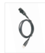
Programming Cable (USB Port)