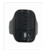
Wireless Finger PTT