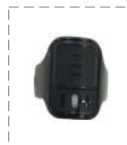
Wireless Ring PTT