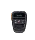
Wireless Remote Speaker Microphone